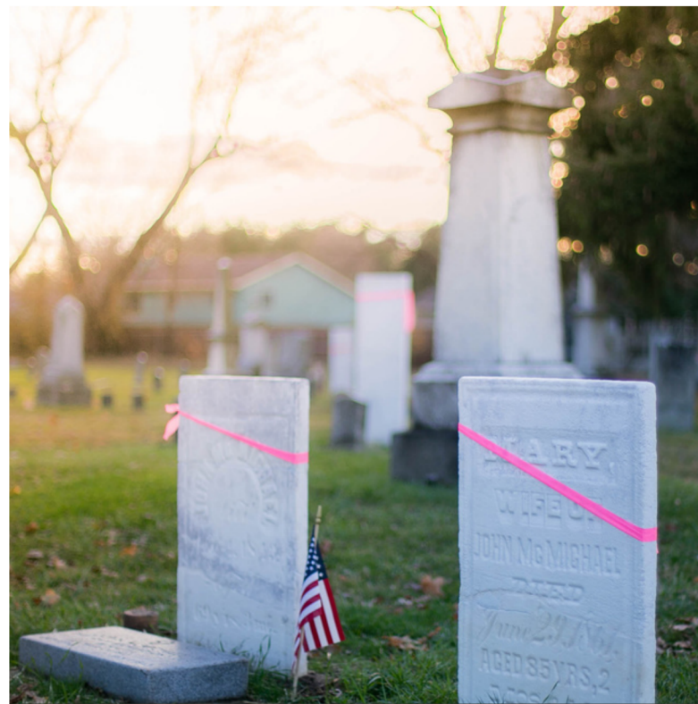
Harris Township made it possible for stones to be repaired and cleaned in 2022-2023.